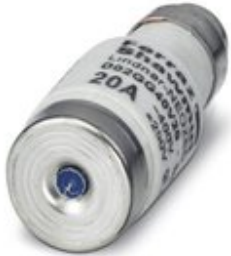
Fuse insert, nominal current: 20 A, length: 36 mm, diameter: 15 mm, color: blue

Please be informed that the data shown in this PDF Document is generated from our Online Catalog. Please find the complete data in the user's documentation. Our General Terms of Use for Downloads are valid ( http://phoenixcontact.com/download )